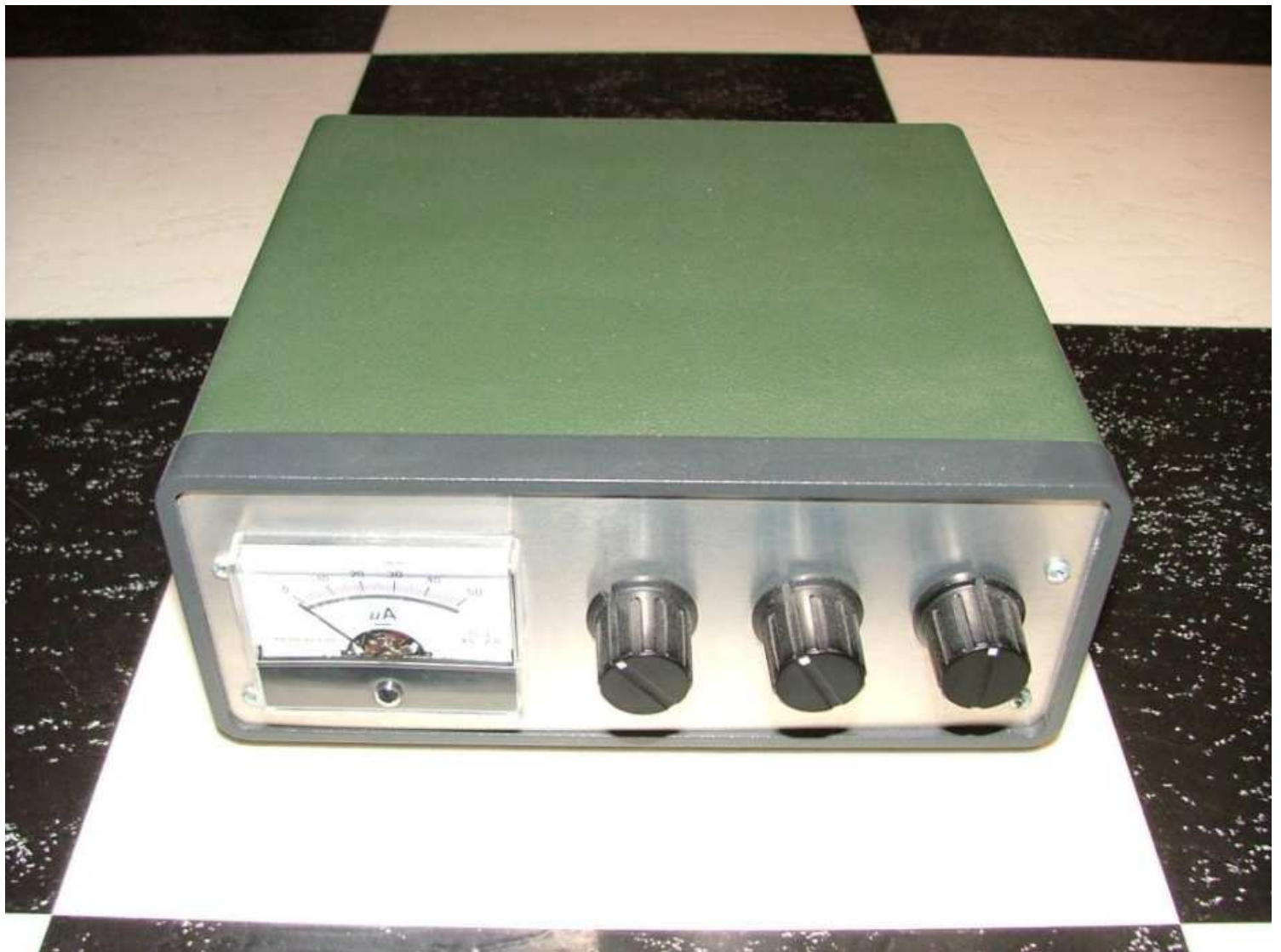
Frontside of the Artificial Ground device